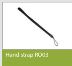
Hand strap RO03