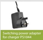
Switching power adapter for charger PS1044