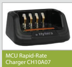
MCU Rapid-Rate Charger CH10A07