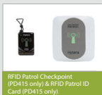
RFID Patrol Checkpoint (PD415 only) & RFID Patrol ID Card (PD415 only)