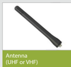
Antenna (UHF or VHF)