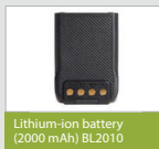
Lithium-ion battery (2000 mAh) BL2010