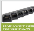
Six-Unit Charger including Power Adapter MCA08