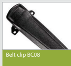
Belt clip BC08