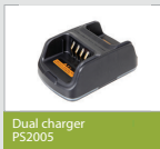
Dual charger PS2005