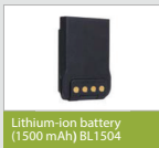
Lithium-ion battery (1500 mAh) BL1504