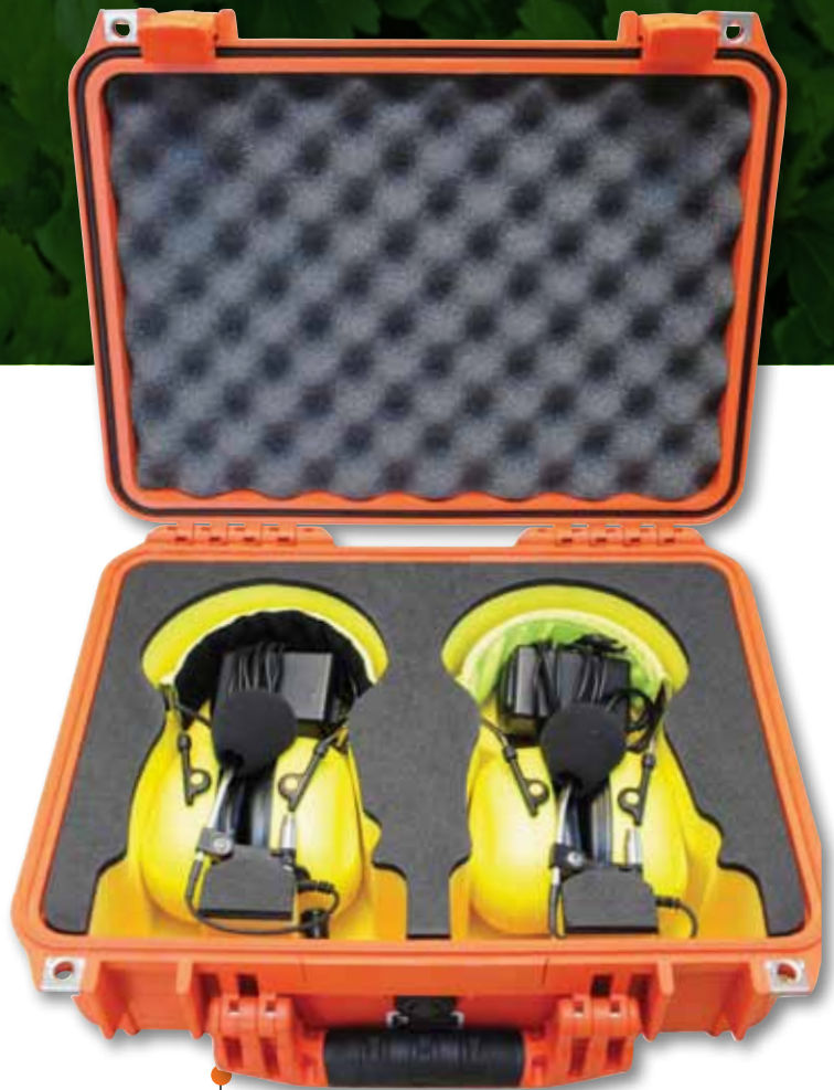
Peli case with cut-out foam available

Communications between operators is so simple, no need for any hand signals, shouting and having to stop work! No buttons to push and hold in when talking, simply turn the headsets on and continue working.